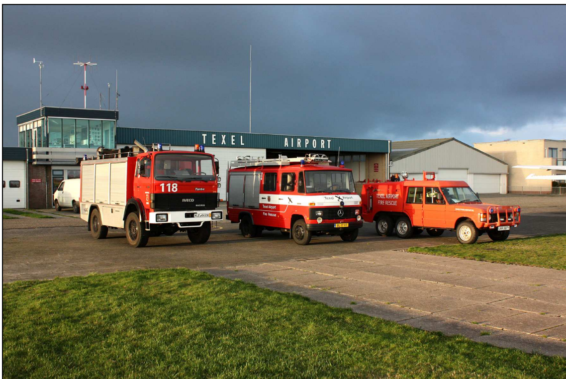
From left to right: New IVECO (2000 ltr), Mercedes (1000 ltr) and the Range Rover which has already been disposed of.

Texel Airport meets standard RFF3 with the current tenders and available manpower. This means that aircraft with a length from 12 to 18 metres have no problem visiting Texel. This includes amongst others: Cessna 208B, Beech King Air 200 and 300, Dornier 228, Pilatus PC-12 and the various Citations.