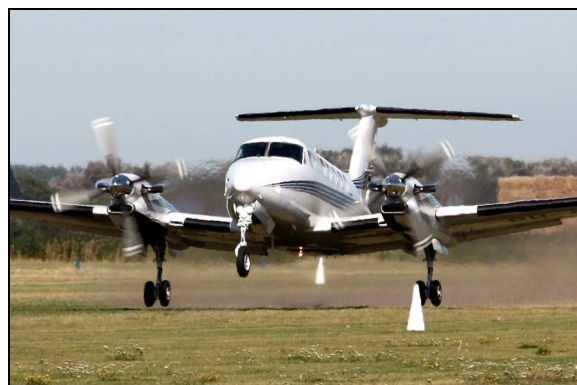
Dakota PH-DDZ. King Air 300, PH-ACE.