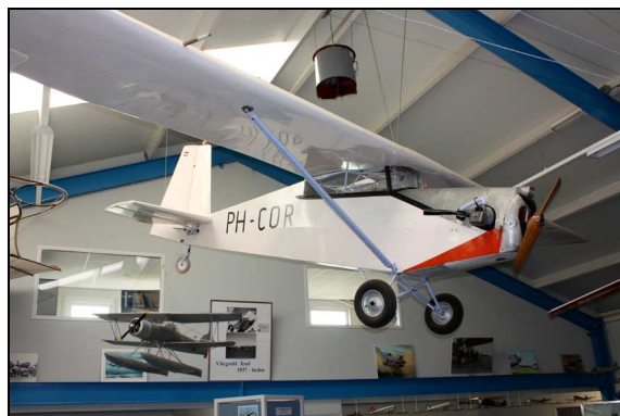
The PH-COR which made an illegal flight from the beach at Wijk aan Zee.