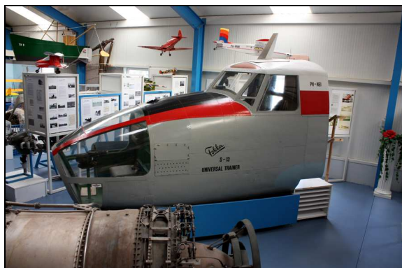
The cockpit section of a Fokker S-13.

For guided tours please contact the museum directly: +31 222-311689 or info@lomt.nl .