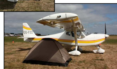
Photos of the successful fly-in of 2009.