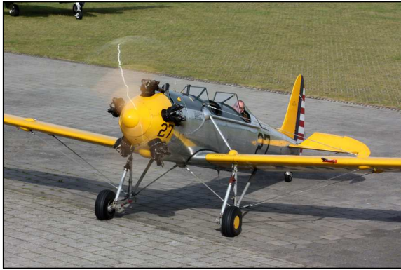
G-AGYY, oldest taildragger.