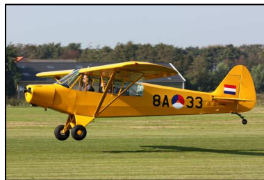
3 rd Prize for N298SQ.