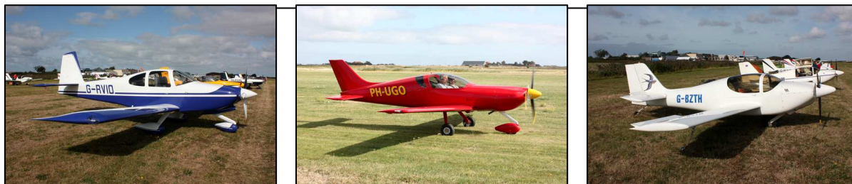
Visitors at the fly-in: G-RVIO (RV-10), PH-UGO (Pulsar) and G-BZTH (Europa).

The next Dutch Light Aircraft Fly-in is planned from Friday 17 th until Sunday 19 th September 2010!