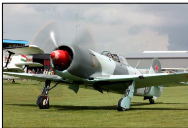
Nr. 2 was the YAK-3.