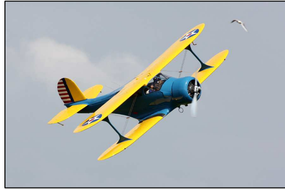
N295BS, the "best of show".