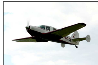
Longest distance: N7600E.

The next Texel Taildragger & Old Timer Fly-in is planned for May 2011.